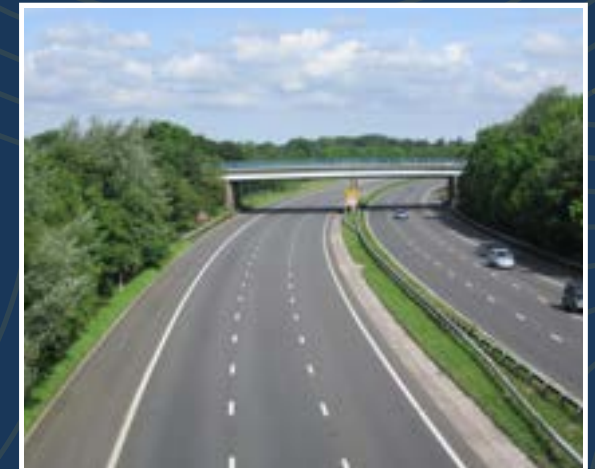
Near to Motorway