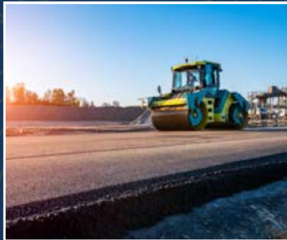
Excellent Road Network