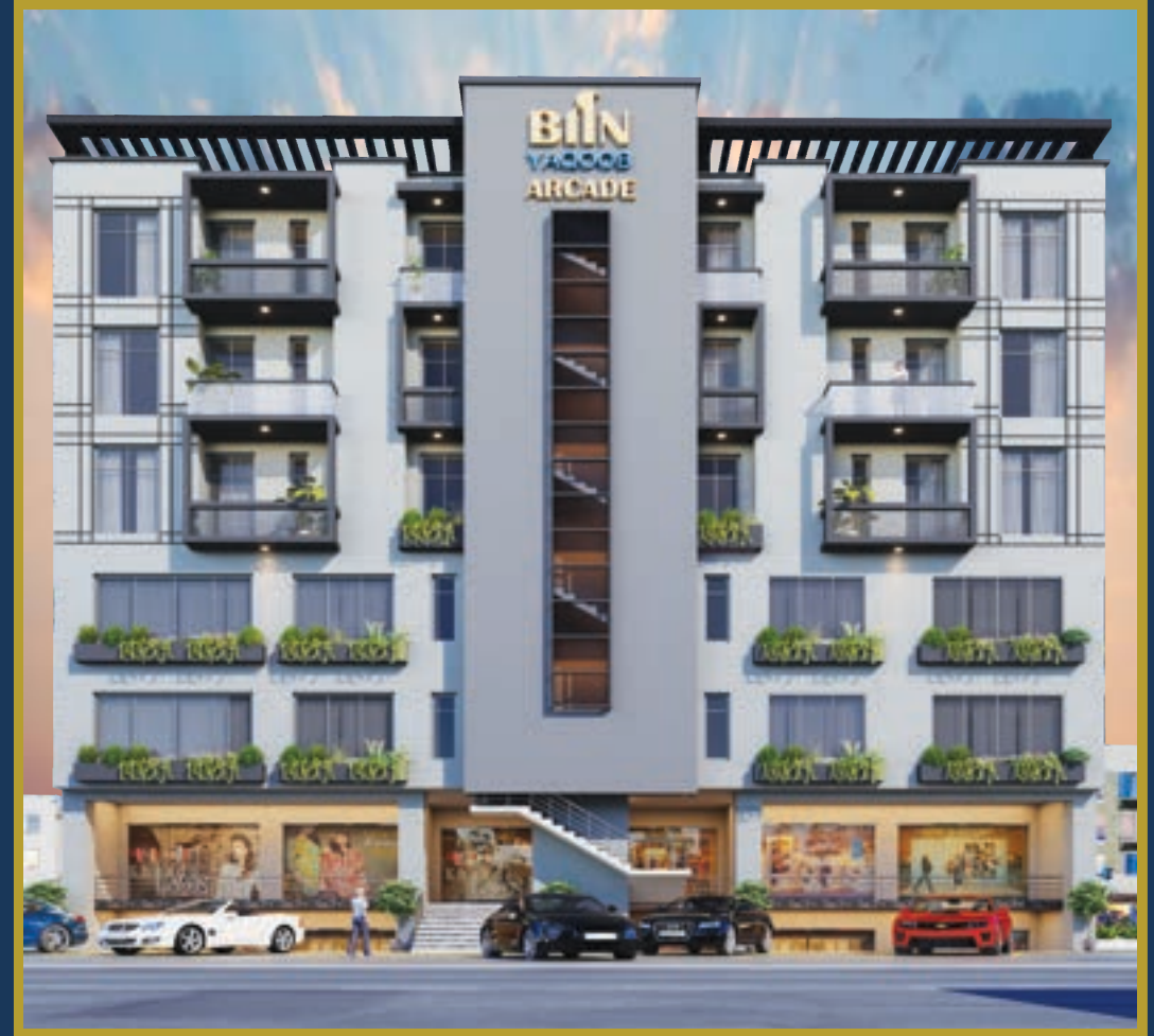
BIN YAQOOB ARCADE