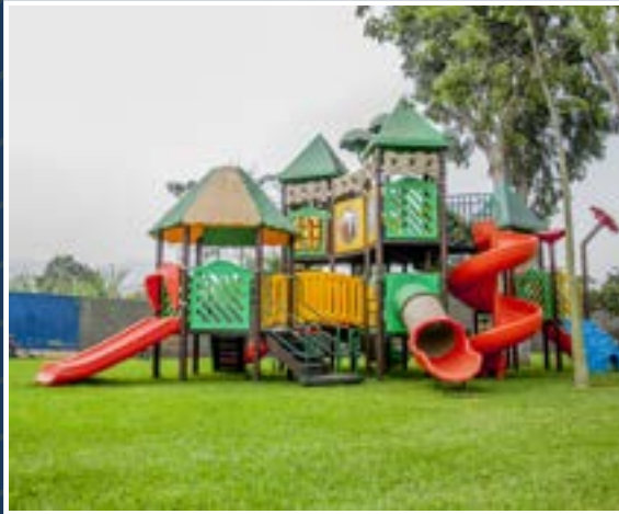
Parks & Children's play area