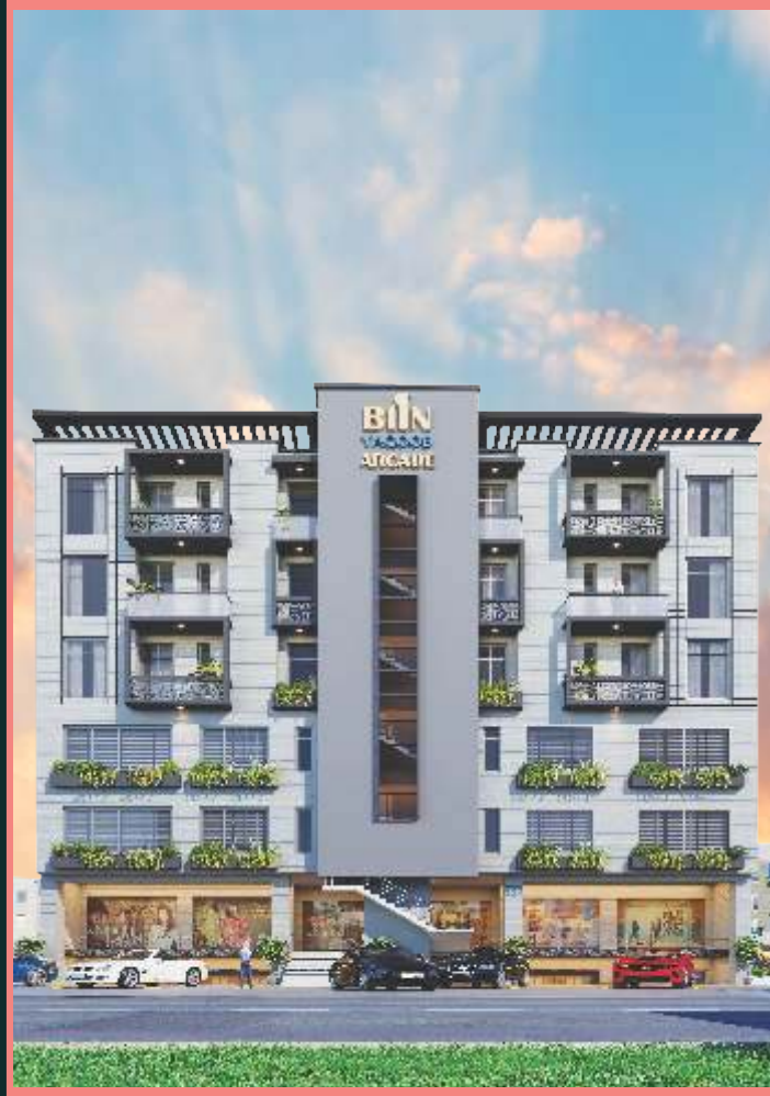
BIN YAQOOB ARCADE