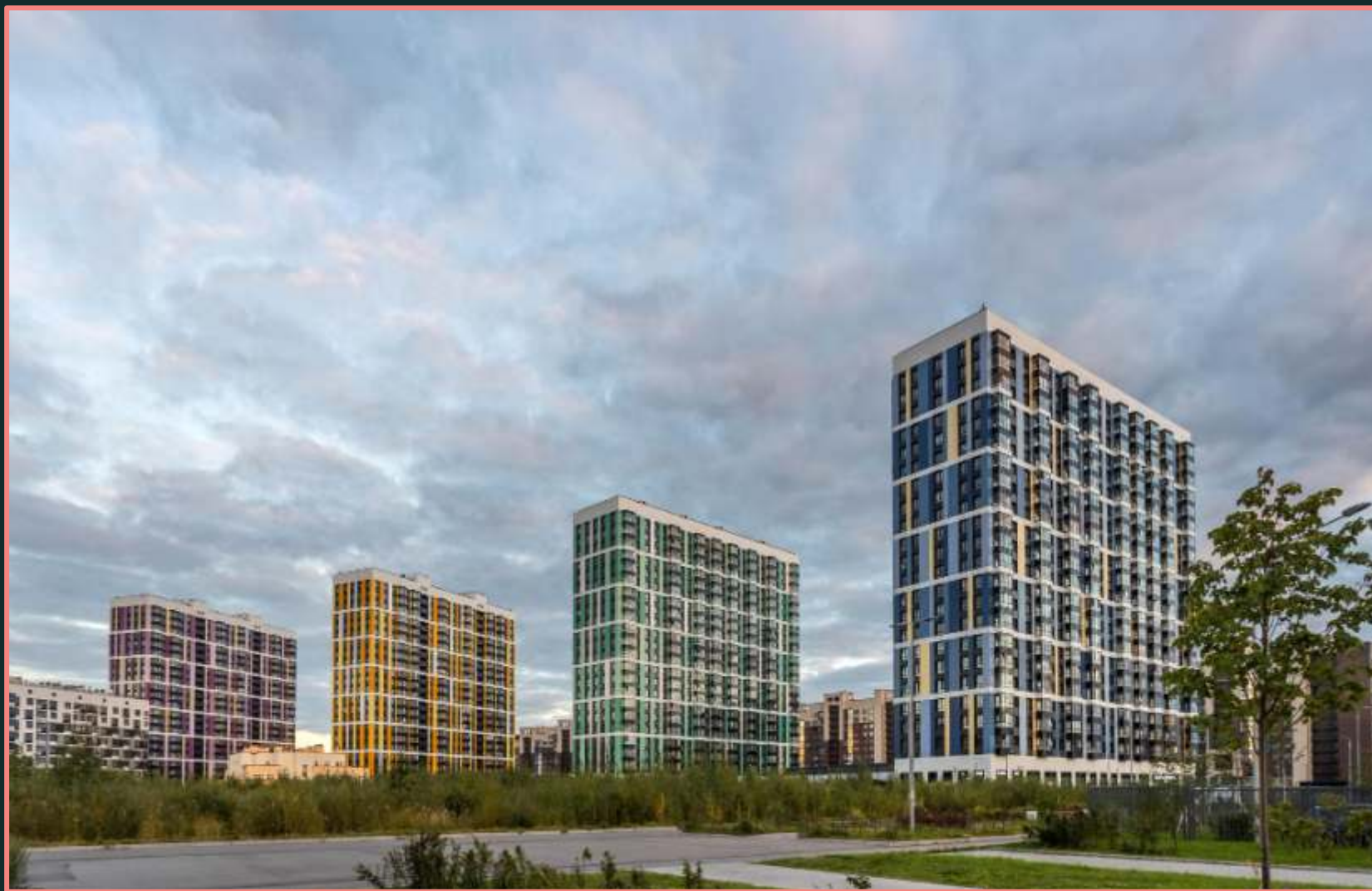
Commercial Towers 4