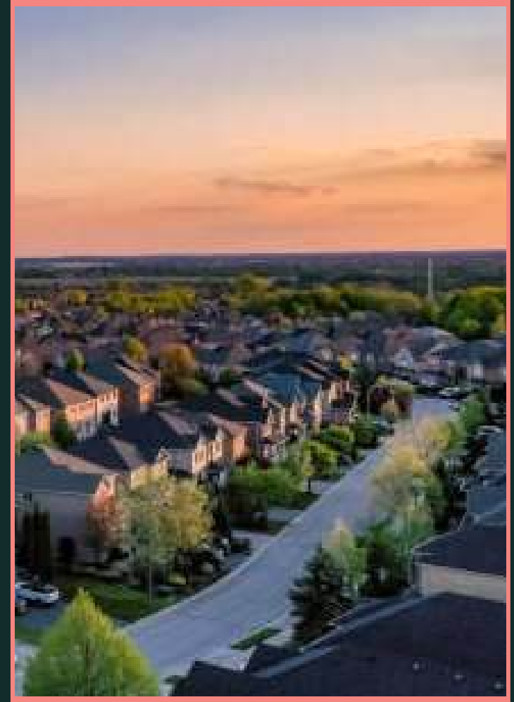
BIN YAQOOB VALLEY